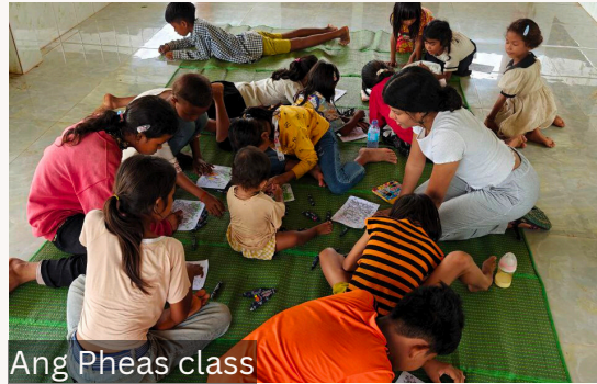
Ang Pheas class