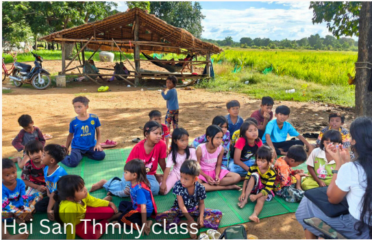
Hai San Thmuy class

Thank you all for praying as we travelled from Cambodia, to Thailand, to Japan, to Denver, and then finally to Bayfield, our home in the US. The travels went well, and the only issue we had was having to carry our suitcases up and down the stairs while crossing the land border to Thailand. We are grateful to God for being with us the whole time and allowing us to have this opportunity to visit family, to rest, and to share with those in the US what the Lord has been doing the last 2 years in Cambodia.