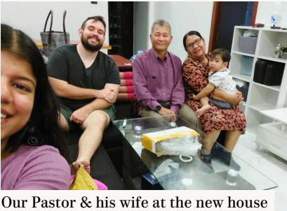
Our Pastor & his wife at the new house

Our house contract was ending in February and instead of renewing it this time, we decided to go house hunting in January (yes, only a day after landing 😊). 2 days later we had found a new house to rent. It is much different and smaller from our old place. However, it is more homey with an outside area, a grass patch with trees and a gate! We also already have friends in this new neighborhood. We are still in contact with our previous landlord who had made renting much easier for us. We are thankful for this good relationship we built with her. We prayed together on the last day at the old house, and she was genuinely happy that we found a better place and was supportive as we ended our landlord-tenant relationship. Please pray for her to choose Jesus first. We had gone to church together multiple times and prayed and worshipped together, but she still goes back to the temple and observes the Buddhist festivals. Pray that we will have wisdom and words from the Lord to follow up with her.