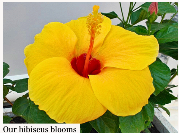
Our hibiscus blooms