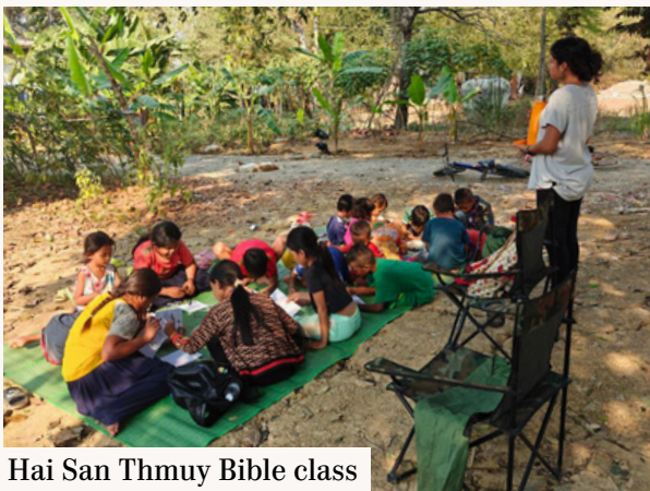
Hai San Thmuy Bible class

Our students were also happy to have us again, and we were very happy to be back with them. They were elated over the gifts and candies we brought them. Bryce's class grew from 6 to 15 students and Elza's class shrunk to 7 students. More children have been joining throughout the weeks, and we hope to see even more kids come and study with us. We have been reviewing lessons and were impressed to see many still remember them. For those who don't remember and for the new students, we're spending time one on one and giving extra homework to help.