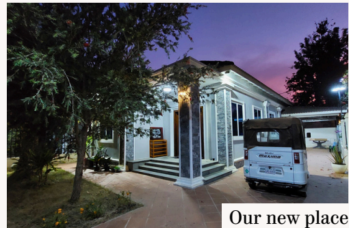
Our new place

One of the reasons we decided to move was because the old house had a few issues; from leaky ceilings, to moldy walls, to tiles popping on the ground and top floors. We had gotten a lot repaired, but the issues kept coming back.