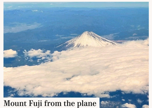
Mount Fuji from the plane

The few days stop in Tokyo, Japan was a blessing. There is a rich culture there as well as advanced technologies. Everyone in the city looked extremely busy and in a rush. But everything was so well organized. For example, every person knew they should keep to the left and that cleared the way for those who were truly late and had to run. How cool is that? We're also grateful to God for google translate and train apps!