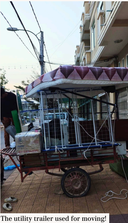
The utility trailer used for moving!