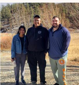
With Bryce's dad & mom before flying out