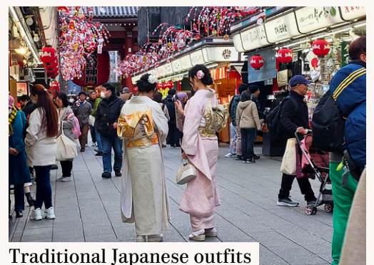
Traditional Japanese outfits