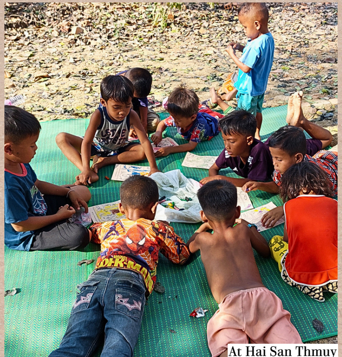
At Hai San Thmuy

Khmer New Year will be celebrated from the 14th to 16th of April. Lots of schools will be closed for at least a week and many will even be closed for a whole month because families go on trips to other family members' houses before travelling back to the city where most of them work. We're giving our students a week break, and we'll use that time to go hospital touring in Phnom Penh. Please pray for us to make the right decision when it comes to choosing the right place to give birth at. We have found a good hospital and so far have heard only great feedback from those who have received treatment there. Pray for God's wisdom as we talk to the doctors and that we'll be able to set a good relationship with them.