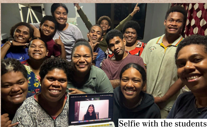
Selfie with the students